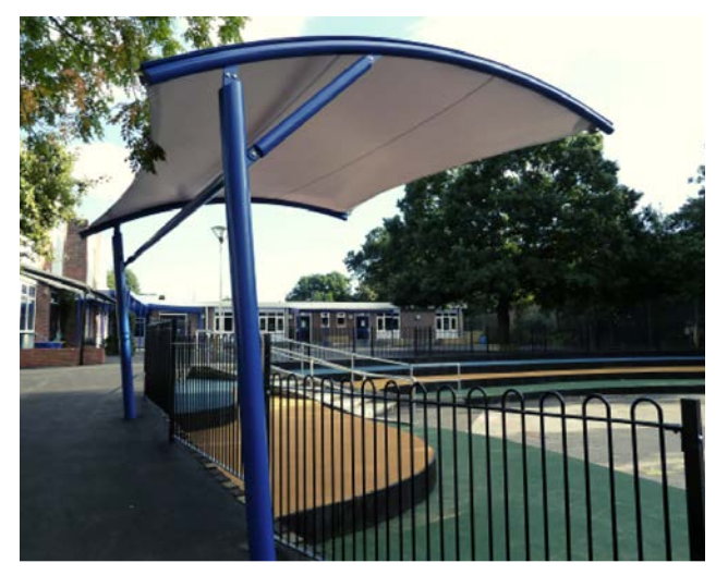
Concord Alton Waverley